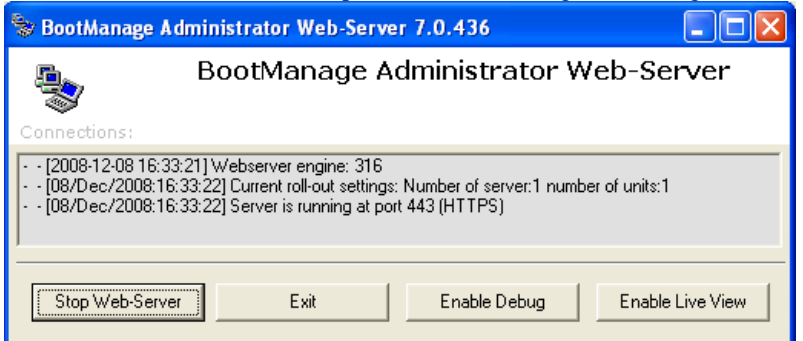
During the start, the above messages should be displayed.

The first start of the BMA web server should be performed as application, so that one can observe the actions and possible error messages in the log window.